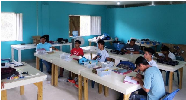
Alvin Young Nazarene School Classroom